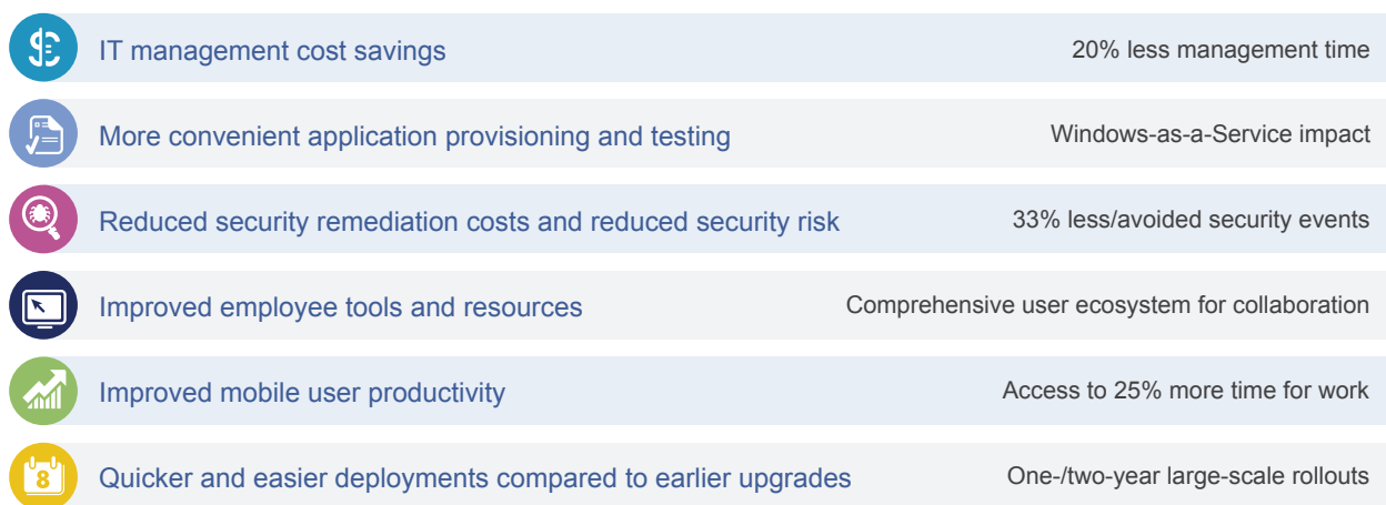
Figure 4: Reported gains from Windows 10