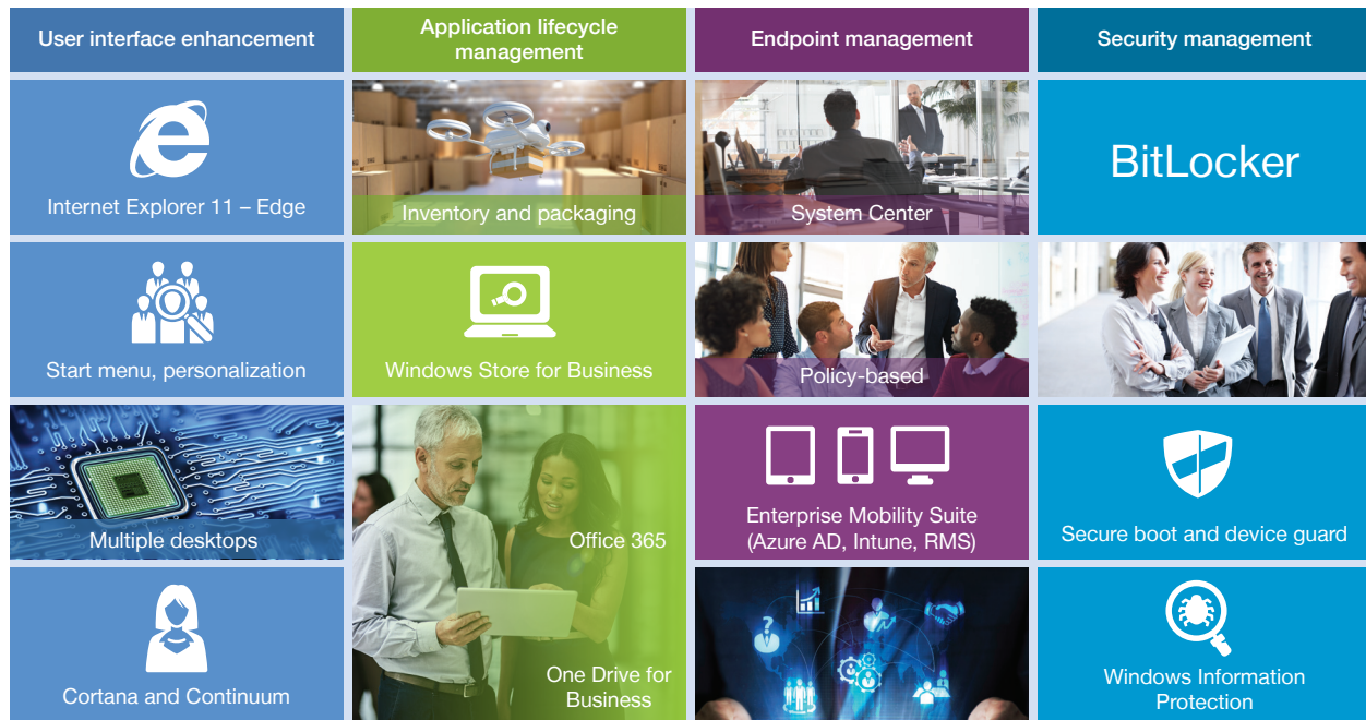
Figure 1: Compelling Windows 10 features driving enterprise adoption